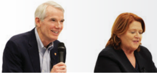
LEFT + BELOW: 'Civility in Polarized Times' event held February 5, 2024 featuring Senators Heidi Heitkamp and Rob Portman