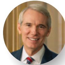
ROB PORTMAN Founder/Board Chair, Portman Center for Policy Solutions