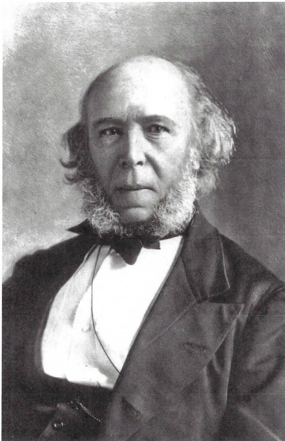
Herbert Spencer.

growing gulf between the rich and the poor as well as the many differences between cultures all over the world.